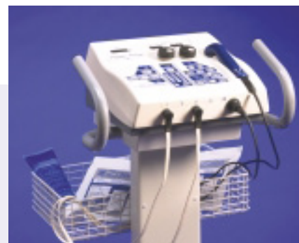
The model 93 or 94 cart offers a sturdy treatment platform for heavy clinical use.