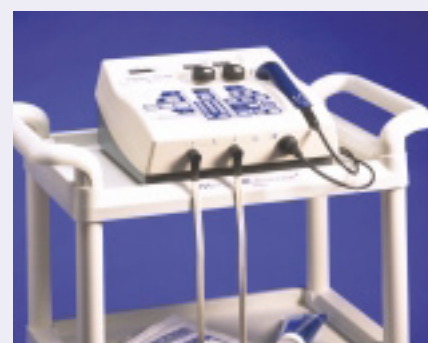
The economical model 73 cart includes 3 shelves to accommodate Mettler units and accessories.